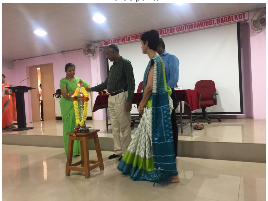
Lighting the lamp