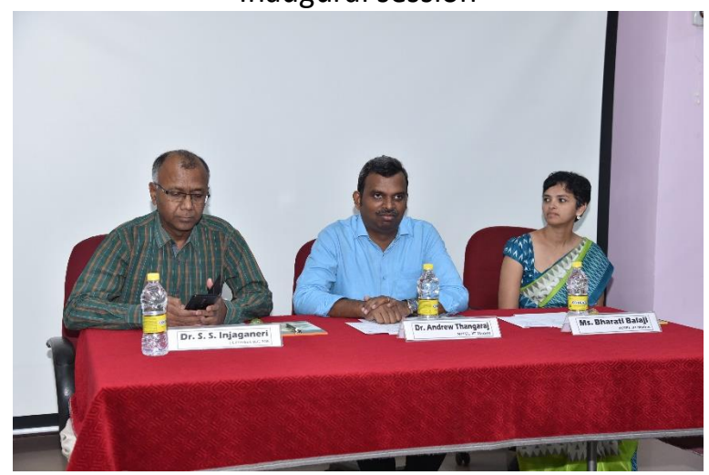
Principal along with the Guests