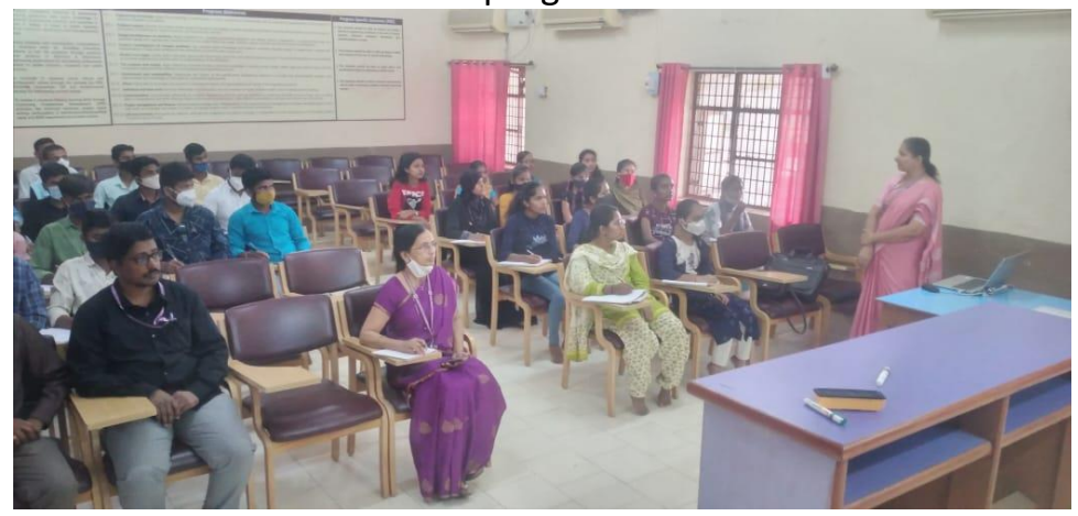
Faculty and students - Electrical and Electronics Engineering Department